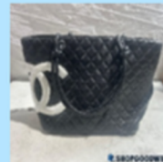
Y2K Chanel Carryall Shoulder Bag $1,234 Lorain Store