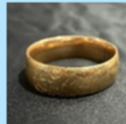
14K Gold Floral Design Bracelet $1,276 Sheffield Store