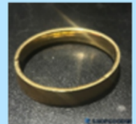
14K Clasp Style Bracelet $950 Oberlin Store