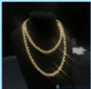
22in 12K Gold Chain Necklace $2,801 Vermilion Store