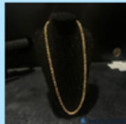
24in 18K Gold Rope Chain Necklace $1,603.99 Lorain Store